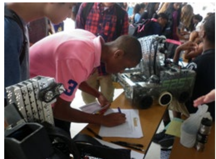
Students see what the robotics club has to offer at Club Rush.